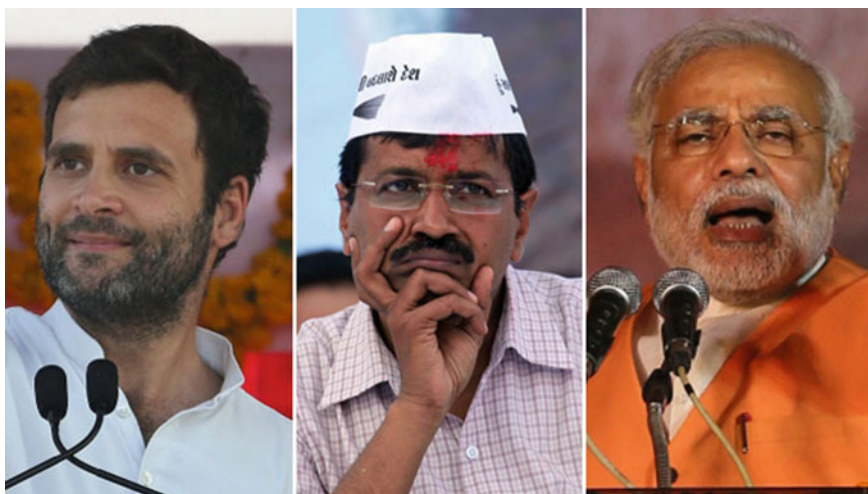
Mr Gandhi, Mr Kejriwal, and Mr Modi, candidates in the 2014 Lok Sabha election in India